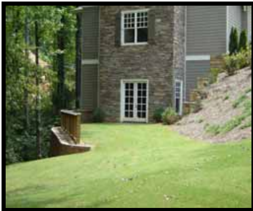
Pool site off terrace level

Family room with gas fireplace adjoins kitchen with granite counters and custom wood cabinetry, all stainless appliances, DACOR 6 burner gas range, micro-wave, warming draw, ASKO dishwasher and side-by-side Sub-zero refrigerator