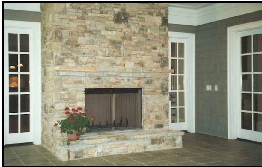
Exterior covered porch with fireplace