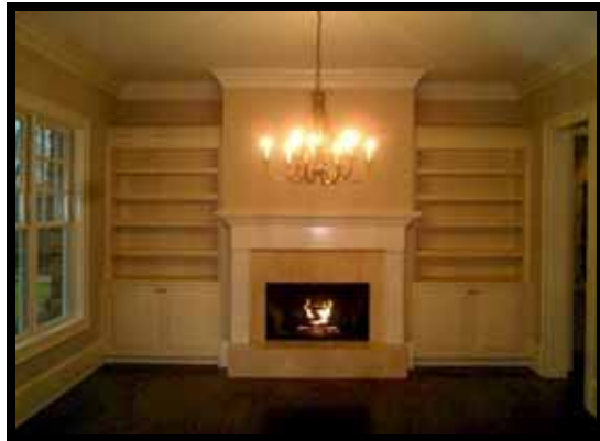
Banquet size dining room with fireplace, gas logs auto light