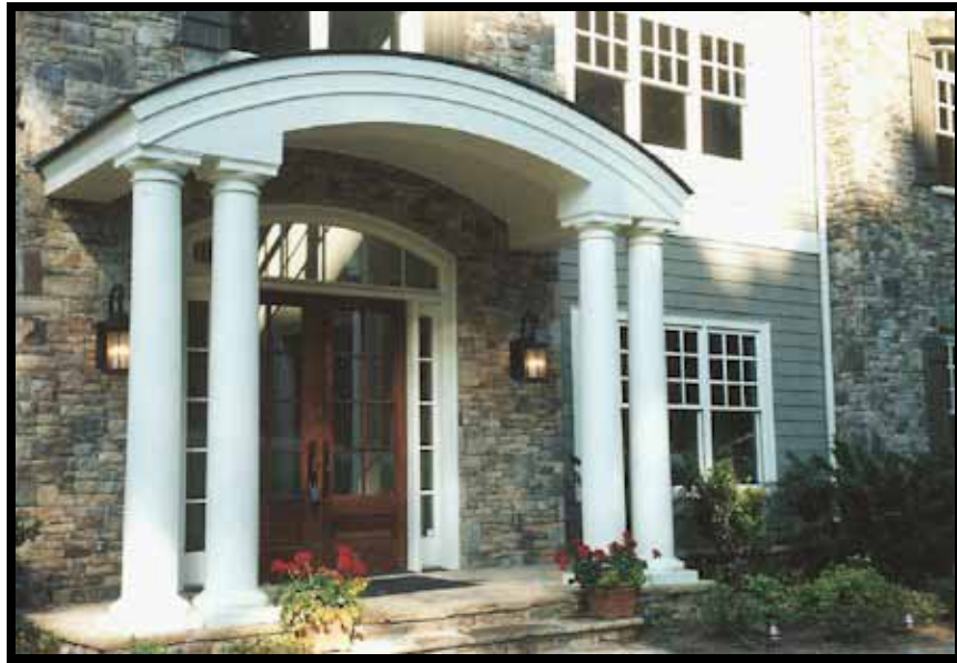
Covered front porch