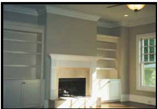
Master bedroom with built-in cabinetry and fireplace, wide planked oak floors